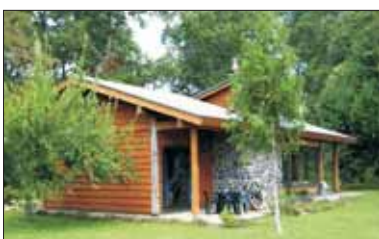
One of the comfortable lodges at Fundo Chacaipulli