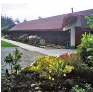
The honey plant at Rio San Pedro