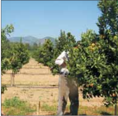
Some of Ian's hives