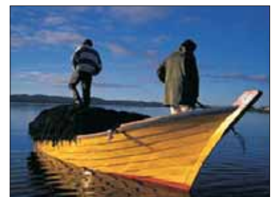
Fishing for oysters