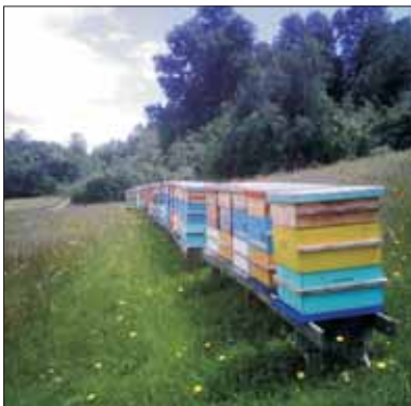
Some of Ian's hives